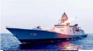
GS III: Internal Security: Defence