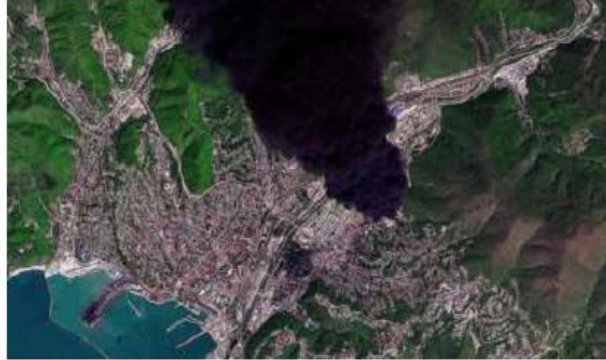
A satellite image showing a plume of smoke rising from the Tuapse oil refinery in the Russian port of Tuapse on April 28.

The facility had been hit previously on April 16, April 20, and April 28. Regional governor Veniamin Kondratyev said a fire at the city's oil refinery had also been extinguished on